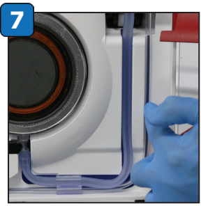
Place the larger blue tubing in the groove to the left and the smaller tubing to the right, close and latch the door