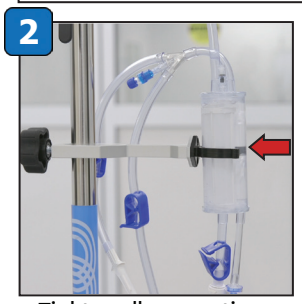
Tighten all connections and snap the reservoir chamber into the support

Plug the main connector of the detachable power cable into a dedicated circuit breaker. Fully seat the device connector (C-19) of the power cable into the power receptacle on the back of The Belmont® Rapid Infuser RI-2. If a moisture quard is present, ensure it is over the device connector and at against the back of the machine.