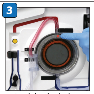
Load the circular heat exchanger with the red arrow pointing up