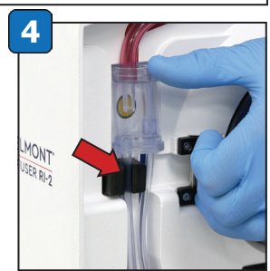
Place the pressure chamber into the pressure chamber well and press the infuse line into the air detector