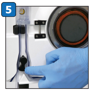
Place the infuse line to the left of the valve wand and the of the valve wand