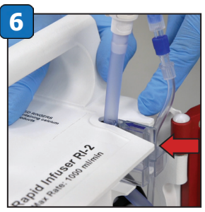
Firmly position the interlock block on top of the shelf with thinner recirc line to the right the blue arrow pointing inward